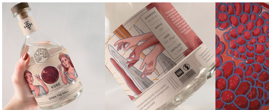
Jaz Baker, 2020 AGDA Distinction - Student Identity