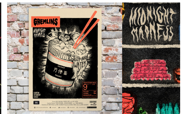
Reilly Nylund, 2020 AGDA Merit - Student Print